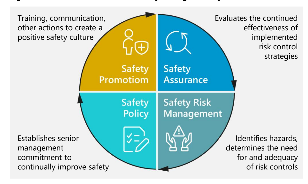
Figure 1 – The Four Elements of a Safety Management System

The rule requires systems to measure and report safety performance and is proportionate: the organisation's system is scaled to the size and complexity of its operation.