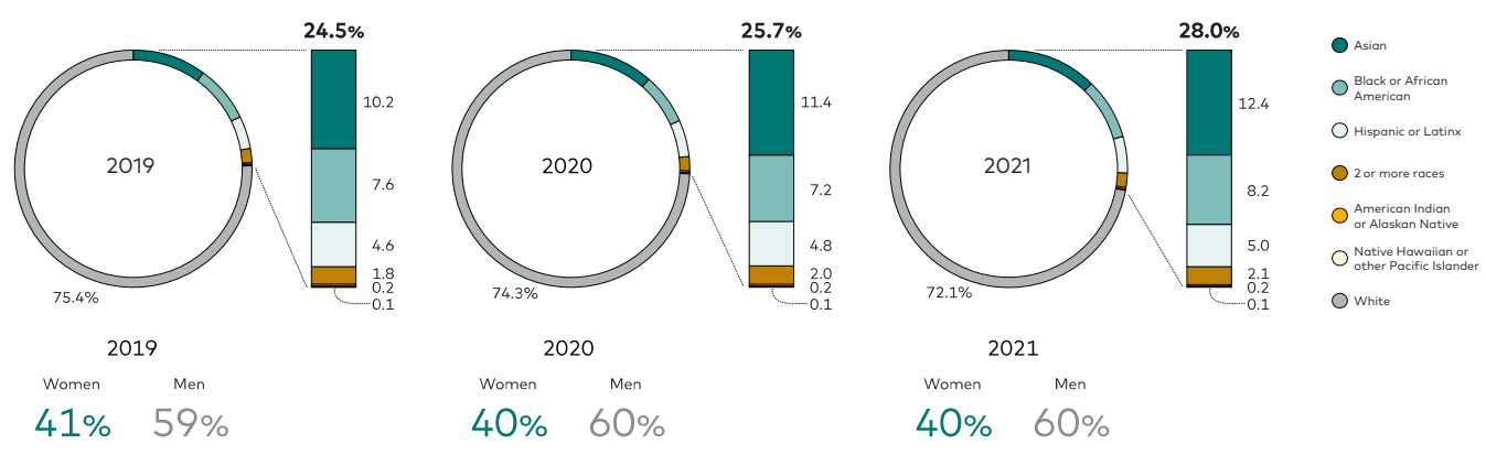
Figure 1. Vanguard workforce by race/ethnicity (US) and gender (global)

Note: Totals may not sum to 100% due to rounding. Source: Vanguard, as at 31 December 2021.